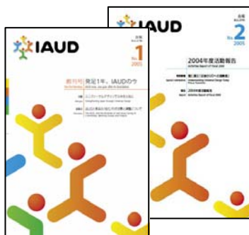
IAUD bulletin cover design

We are currently clarifying the basis for establishing guidelines; from existing data, consulting specialists, and gathering audience opinions as we articulate the guidelines and verify their effectiveness. We will express the guidelines themselves more clearly (to make them more broadly applicable) and publicize them so that they are widely understood and adopted.