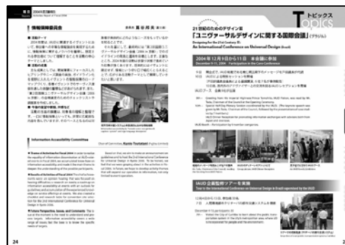
Bulletin pages in Japanese and English.